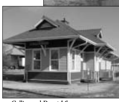
Collinwood Depot Library, Wayne County

only be spent on transportation projects. Through those federal funds, TDOT is able to provide funding for transportation related historic preservation projects. The Transportation Enhancement Program (TE) began in Tennessee in 1991 with the passage of the Intermodal Surface Transportation Efficiency Act (ISTEA). In 1998 the federal government provided more funds with the Transportation Equity Act for the