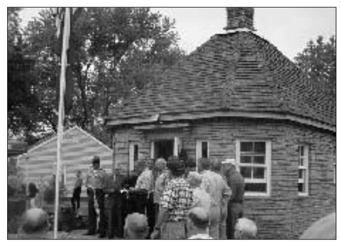
1936 Tennessee Highway Partol Station Museum.

The Tennessee Highway Patrol Building on U.S. 70 in Rockwood was built in 1936 and used as a substation for the highway patrol until a new larger building was constructed next to it in 1952. On June 3, 2005, the highway building again opened for use, this time as the 1936 Tennessee Highway Patrol Station Museum.