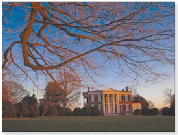
Robin Hood, Rippavilla, 2010

December 6, 2010 through January 16, 2011. The book should be available through local retailers and at museum and historic site gift shops.