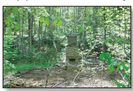
Young Cabin Site.

The Great Smoky Mountains National Park recently began the demolition of multiple structures in the Elkmont Historic District. The MOA outlined the future of Elkmont and stipulated which buildings within the historic district were to be preserved, restored, or demolished. The Elkmont Historic District consists of four smaller communities: Daisy Town, Millionaire's Row, Society Hill, and the Wonderland Club. Daisy Town is the site of the largest collection of remaining Elkmont structures. Alternatives were proposed to utilize the cabins as overnight