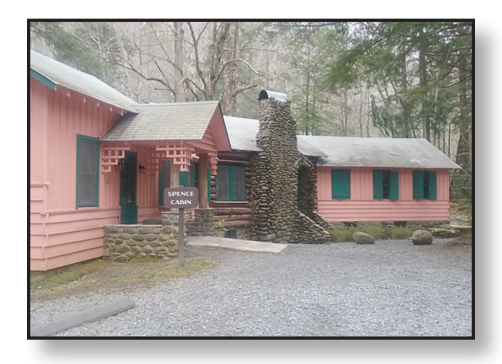
Spence Cabin Site, Elkmont, GSMNP

accommodations for park visitors, but resistance led to the cabins being preserved for visitation by day visitors. A collection of cabins nestled closely together, Daisy Town is being preserved and interpreted so future generations will know of the community that once was nestled within the National Park. As stipulated in the MOA, the NPS has already completed a historic structure report on each remaining structure and is currently in the process of stabilization efforts. The Chapman Cabin, located within Society Hill, is receiving the same preservation treatment as the Daisy Town cabins.