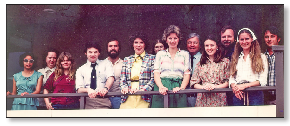
TENNESSEE HISTORICAL COMMISSION STAFF, 1979

Today the Tennessee Historical Commission oversees a portfolio of 17 state historic sites under its authority, managed by partner non-profits. As of 2019, there are 18 professional staff positions. The Board of the Commission consists of 29 individuals, with five ex officio positions, and 24 members appointed by