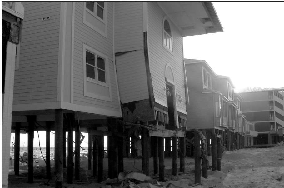
Figure 1. Stairs did not break away cleanly, resulting in damage to the elevated building.

A solid entry door capable of resisting all design loads must be installed at the top of any access stairs or ramps. Access stairs are sometimes constructed inside a breakaway enclosure, with an entry door at the bottom of the enclosure, but without an entry door into the elevated building. This practice leads to building damage. The lack of an entry door at the top results in a large opening in the building envelope when the enclosure breaks away. This exposes the building interior to higher internal wind pressures and wind-driven rain, and provides floodwaters an easy path into the building.