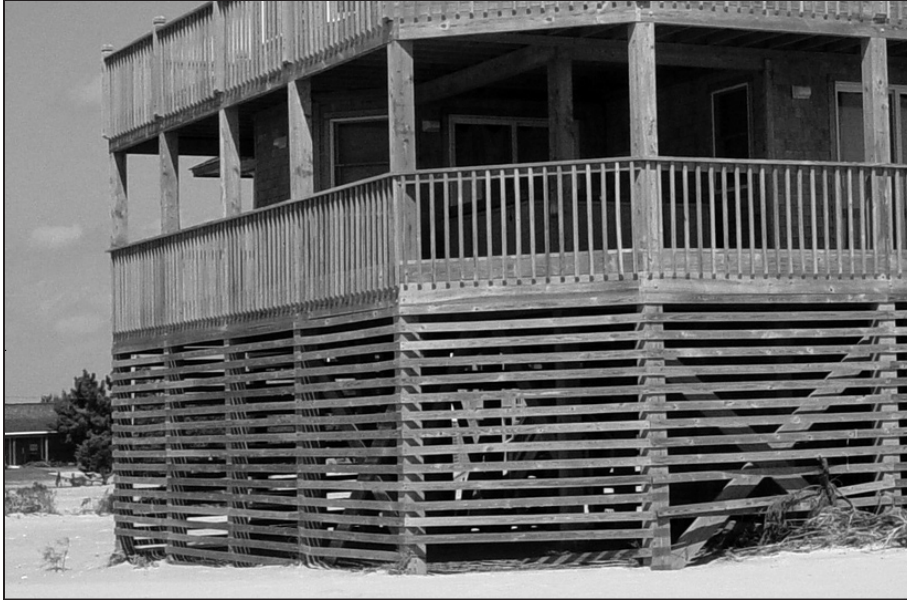
Figure 4. Wood slats installed flat against foundation pilings