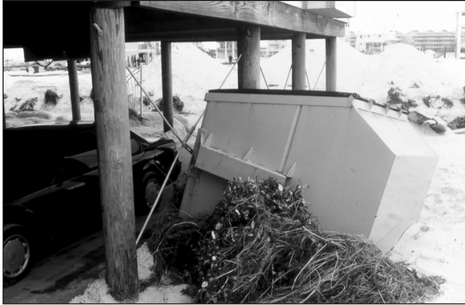
Figure 7. Trapping of floating debris by metal rod cross-bracing