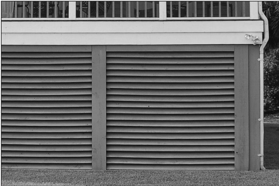
Figure 5. Wood slats installed between pilings at an angle (louvers)

Utility risers, electric meters, and similar elements that must be located below the BFE must be installed to minimize flood damage. The following techniques help to achieve this objective: