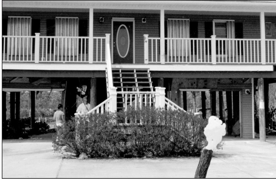
Figure 2. Example of open stairs that minimize transfer of flood and wave forces (note that building codes enforced by most communities require use of risers that prevent passage of a 4-inch sphere).

Massive exterior stairs have been constructed for some elevated homes in V zones (see Figure 3). Stairs such as these clearly act as obstructions and increase the likelihood of trapping or deflecting waves and flood flow beneath the elevated buildings. They are not necessary for building access purposes and are not permitted because they are obstructions that increase the potential for damage.