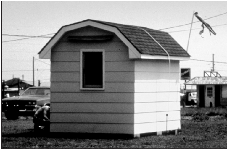
Figure 14. Small accessory structure anchored to resist displacement by wind

structures must be unfinished on the interior, constructed of flood damage-resistant materials, used only for storage, and, if provided with electricity, the service must be elevated above the BFE.