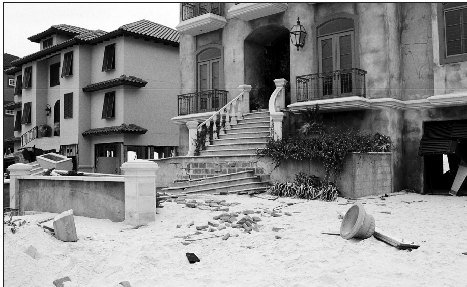
Figure 3. Massive stairs adjacent to an elevated coastal home are an obstruction.

Note that, in some cases, life-safety code requirements will dictate that stairs and stairwells in certain occupancy structures have to be constructed to be fire-resistant and structurally stable even if portions of the adjacent structure fail. Stairs and stairwells that meet these requirements are usually constructed of some combination of steel, reinforced masonry, and reinforced concrete, and will not break away under expected base flood loads and conditions. These stairs and stairwells, typically found in mid- and high-rise buildings, must be designed to withstand all flood loads, including wave impact and floodborne debris impact.