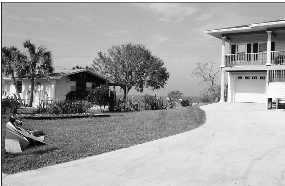
Figure 17. Post-hurricane photo showing elevated building surrounded by gently sloping fill, with adjacent damaged pre-FIRM building (the presence and configuration of the fill were judged by the damage inspection team not to have led to flood or wave damage to the elevated building or the nearby pre-FIRM building).