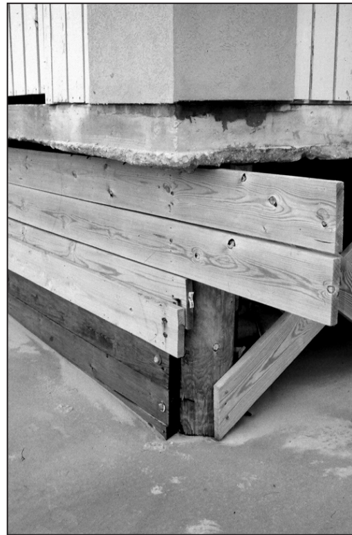
Figure 15. Shore-parallel timbers attached to a pile foundation were intended to act as a bulkhead, but constitute an obstruction and are prohibited.

Guidance for evaluating potential effects of erosion control structures on waves is contained in the U.S. Army Corps of Engineers (2002) Coastal Engineering Manual . Generally, those devices with a steep face (1:2 [vertical to horizontal] or steeper) will result in the greatest wave runup.