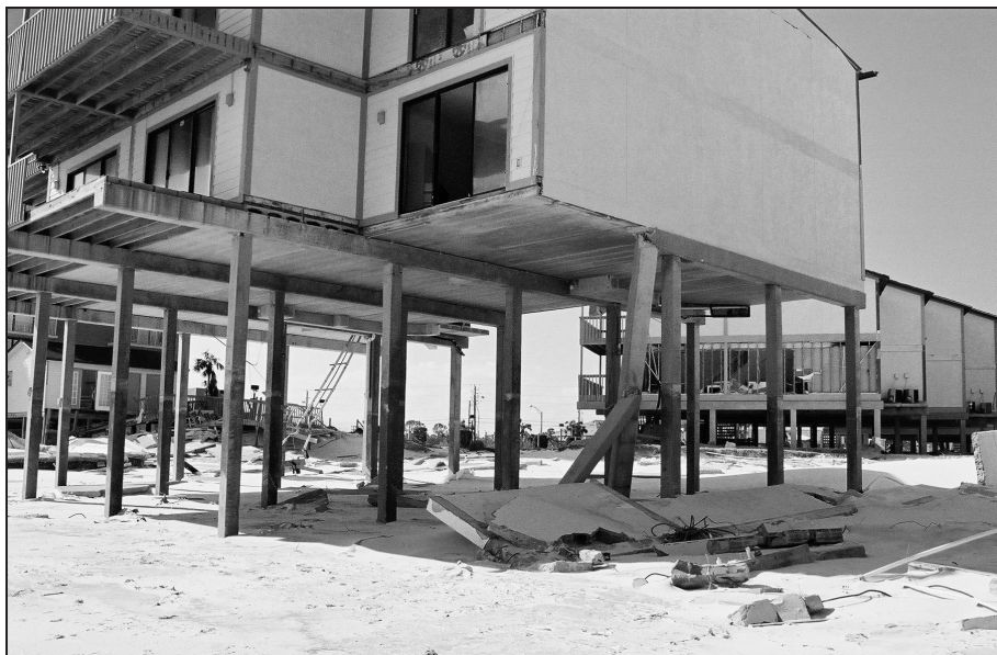
Figure 16. Shore-perpendicular reinforced masonry wall failed and collapsed into the foundation of an adjacent building, contributing to failure of the corner foundation piling and pile cap/beam.

Siting of new buildings near existing fences or walls should be reviewed carefully. Figure 16 shows an example of a shore-perpendicular solid wall that failed during a coastal flood event and damaged the pile foundation of an adjacent elevated building.