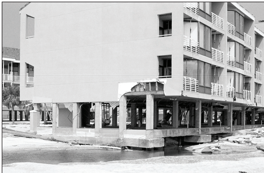
Figure 8. Grade beams must resist flood, wave, and debris loads when undermined.

Grade beams typically are made of reinforced concrete or wood; they are used to tie together the foundation piles or columns to provide additional lateral support. Grade beams that are placed with their upper surfaces flush with or below the natural grade are not considered obstructions and are allowed under the NFIP. However, storm erosion and local scour will often expose and undermine grade beams, leaving them suspended above the post-storm ground profile. Designers must anticipate this circumstance and design grade beams to resist flood, wave, and debris loads and to remain in place and functional when undermined (see Figure 8). Grade beams also must be designed and constructed so that the vertical thickness is minimized, thereby reducing the lateral flood, wave, and debris loads acting on the beam and limiting the transfer of these loads to the foundation. Designers are cautioned that grade beams should not be used as a substitute for adequate number, size, and embedment of piles or columns.