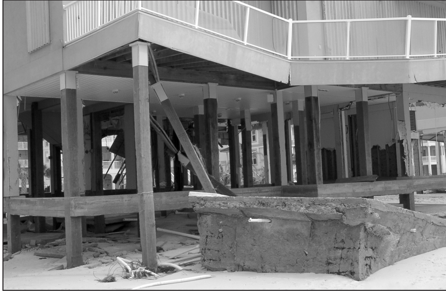
Figure 18. Movement of a spa likely caused failure of two piles supporting an elevated deck.