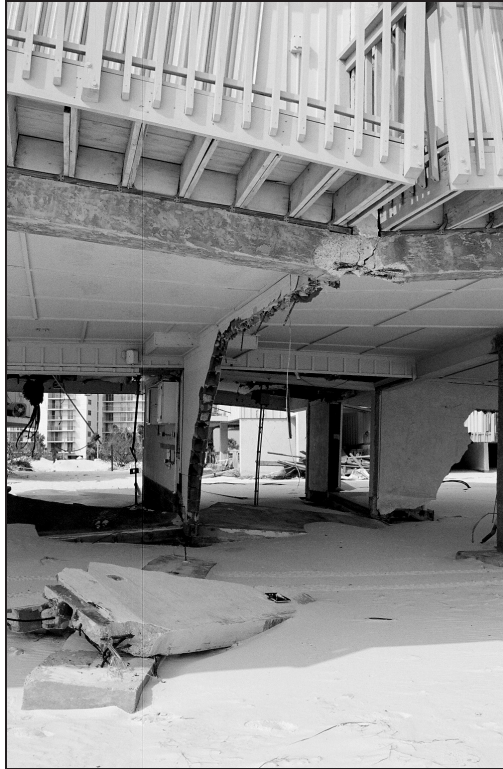
Figure 10. Failure of shore-perpendicular (and shore-parallel) solid foundation walls, and of beam and floor system supported by the shore-perpendicular wall (pre-FIRM structure)

Shear walls beneath low-rise V zone structures, regardless of orientation, are obstructions that are contrary to the NFIP free-of-obstruction requirements. They should not be permitted unless special justification exists, such as the need for a public, military, or functionally dependent, low-rise structure in a V zone, which cannot be supported on piles and columns alone. Even in these cases, they should be allowed only if detailed engineering calculations demonstrate that the foundation and building are designed to resist all base flood conditions (including erosion, which will increase the height of waves and wave forces striking the foundation), all design loads, and all appropriate load combinations.