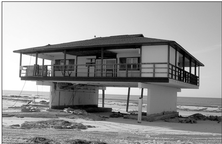
Figure 9. House elevated on shore-perpendicular shear walls. This design approach is risky for low-rise buildings since lateral out-of-plane loads (wind and flood acting on the faces of the shear walls) can be large and special design considerations and detailing are required.

The practice of allowing shear walls beneath low-rise construction is controversial. This is due to the fact that any solid foundation wall below the BFE can act as an obstruction, and these walls can be subject to extreme loads during a base flood event. Indeed, post-flood investigations have found that many such walls do not survive a severe storm event. This is illustrated in Figure 10, which shows an example of a building supported on columns and shore-perpendicular walls, where a wall section failed, leading to failure of the elevated floor beam and floor. In this instance, the building was a pre-FIRM building with the solid walls resting on shallow footings (a means of support not permitted under post-FIRM V zone regulations), and the failure was likely due to both lateral flood loads and foundation undermining.