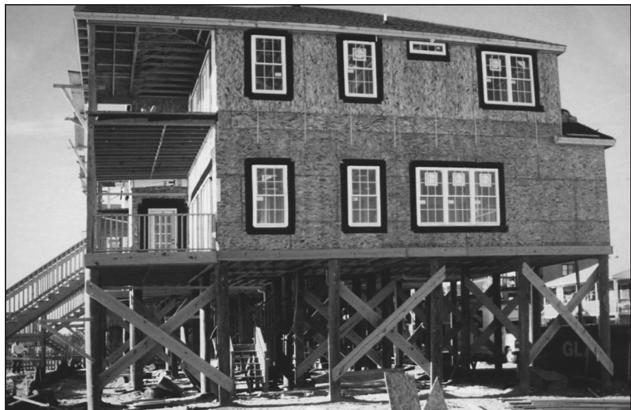
Figure 6. Elevated coastal home with timber cross-bracing, principally in the shore-perpendicular direction

Where foundation bracing is used below the BFE, it must be placed so as not to interfere with the intended failure of breakaway wall panels. Avoiding interference may require eliminating breakaway walls, shifting the location of breakaway walls, or redesigning the foundation so the need for certain braces is eliminated. Breakaway walls and foundation bracing should not be placed in close proximity if either can affect the intended performance of the other.