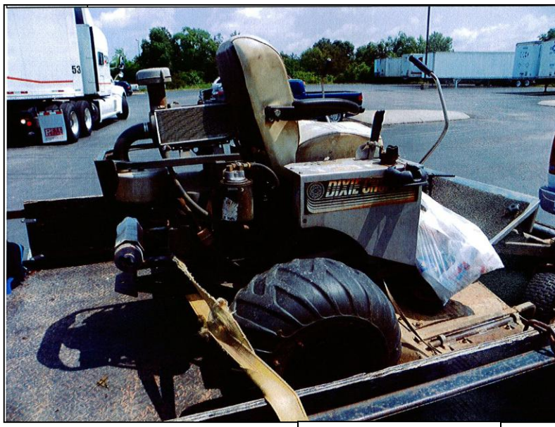
Mower that overturned