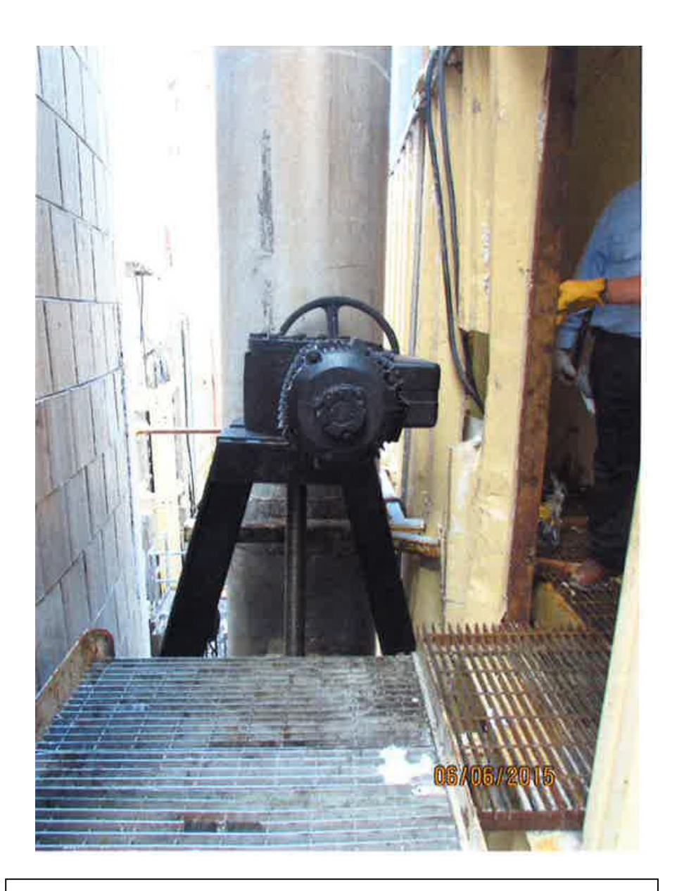
Photo 1 of 2 – This photo shows the view of the valve and the unguarded holes between the platforms and building surfaces.