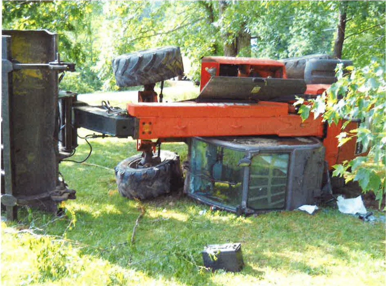
Photo 2 of 2 – This photo shows where the skid steer rolled over on its left side.