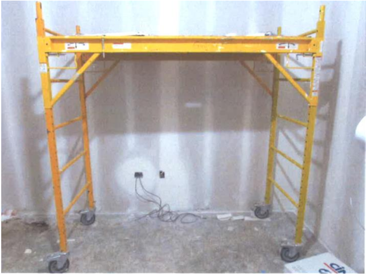
Photo 1 of 2 – Example baker-style scaffold. During interviews, it was determined the wheels (left side when facing forward) on the baker scaffold had not been locked. The incident scene was held until a TOSHA inspection was initiated the next day.