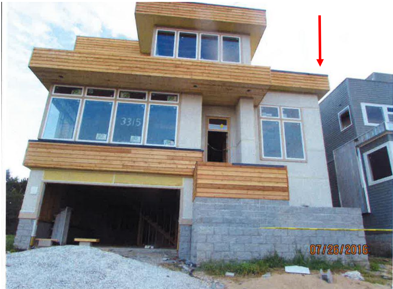
Photo 1 of 2 – Red arrow designates where the victim fell 30 feet from the flat roof.