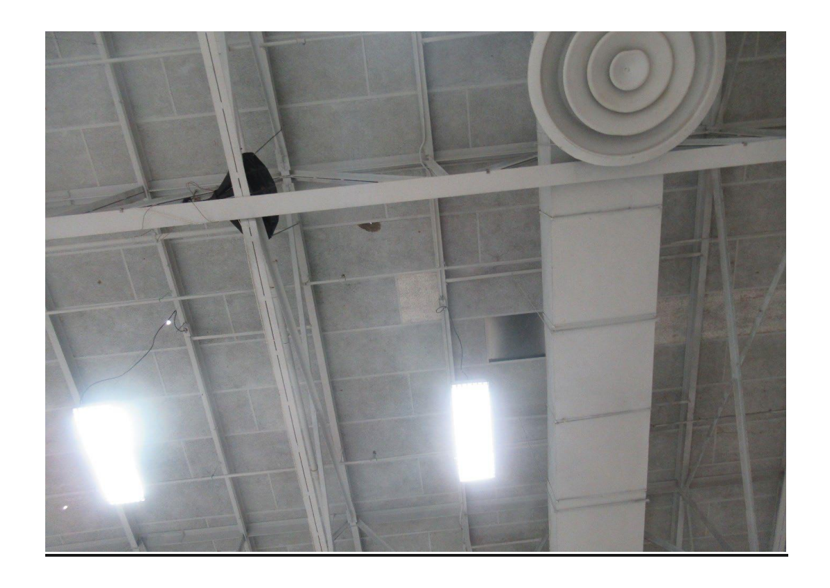
Fall through a roof deck—Insp # 1703349 Jr. Roofing & Construction LLC